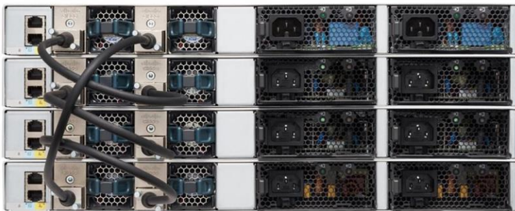
Figure 4. Cisco Catalyst 9200 Series Switch stacked units