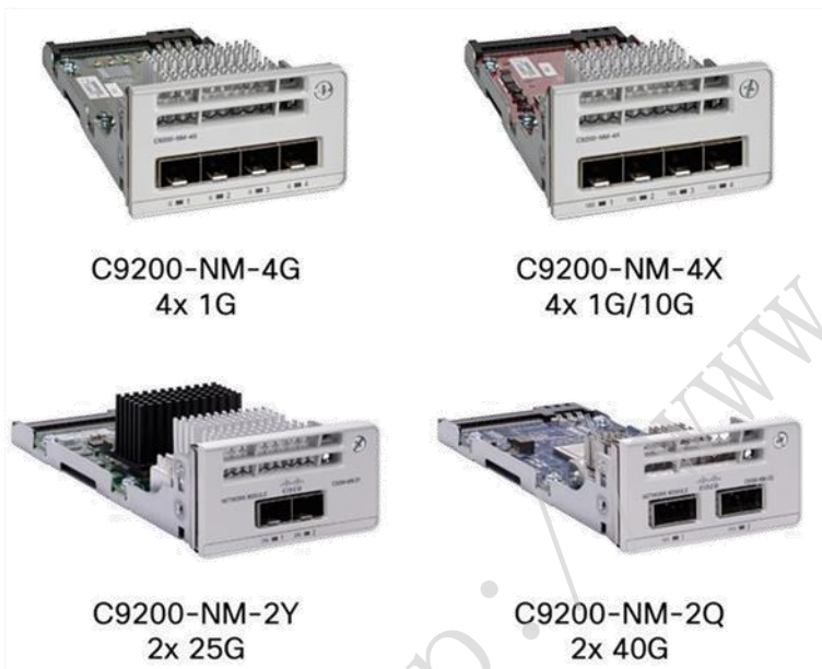
Figure 2. Cisco Catalyst 9200 Series Switch network modules

Cisco Catalyst 9200 Series switches come with modular or fixed uplinks as indicated in Table 1. With modular SKUs, the field-replaceable network modules provide infrastructure investment protection by allowing a nondisruptive migration from 1G to 10G and beyond. When you purchase the switch, you can choose from the network modules described in Table 3.